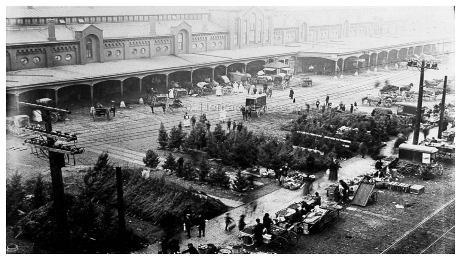
C. 1900 photo of the Ellicott Street side of the market, possibly taken at Christmas time; note the cut evergreens lined up.

Statements of fact have been obtained from sources considered to be reliable, but no representation is made by this firm as to their completeness or accuracy. This firm or persons associated with it may own or have a position in any of the securities or investments mentioned, which position may change at any time, and may from time to time, sell or buy such securities or investments. No opinions expressed herein, should be construed as an offer to sell or a solicitation of an offer to acquire any securities or other investments mentioned herein.