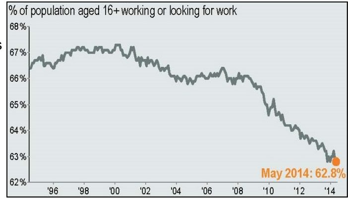
Figure 1: Labor Force Participation Rate

crease. It ain't happening, or so say the populace that have yet to feel wonderful about our slow but steady growth. Some truth can be found in the participation rate (see Figure 1). At