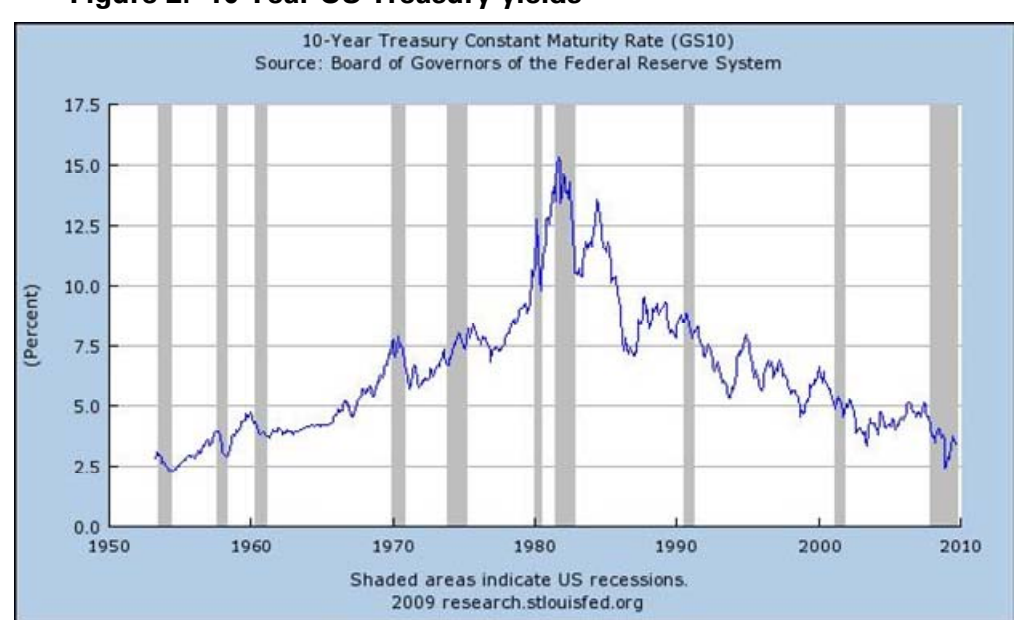
Figure 2. 10 Year US Treasury yields

Mean regression. Let's begin with likely, the meanest. Bonds, especially of the government variety, have just completed a decade of substantially above average Given the aforementioned returns. catalysts, the fact that significant global recovery is underway, that we seem inexorably headed through at least some reflation & potentially some unknown degrees of inflation, and a marmoset could arrive at the conclusion that bonds are likely to regress, meanly. what's bad for them can be quite the contrary for growth and inflation based assets. Stocks, in a period of reflation can experience persistent long term periods of well above average performance as confidence rises, economies expand, earnings accelerate