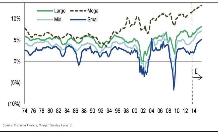
Figure 3: Top 1500: Net Margins by Capitalization, Through 2015E

move forward. Sir Isaac Newton's law of inertia seems to have the S&P by the scruff of the neck. An object at rest of in motion will continue its state until acted upon by an outside force. And that's where this will get more interesting. We can assemble an exhaustive list of sources of that potential energy, but the elephant in the room remains that huge pile of corporate cash, of which 70% of the nearly $3 trillion in cash and short terms rests overseas where it was earned. (see Figure 4) It is almost encouraging that Felix Unger and Oscar Madison, oops, I meant Harry Reid and Rand Paul have jointly introduced an initiative to allow for repatriated corporate earnings to be