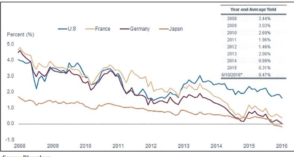
10-year bond yields have fallen in the U.S. and other developed economies

obvious in an environment of the most expensive bonds in the history of mankind. The Swiss 50 year bond now trades at a negative yield, think of it as a 50 year tax on safety... In this interest rate environment stocks win the relative attractiveness argument. Institutional portfolio managers had a record level of cash built up in their portfolios, money we know will be put to work. Continued low levels of inflation and interest rates make most algorithms agree that the equity markets are not over-priced. All this makes volatility likely to remain as our travelling companion as this