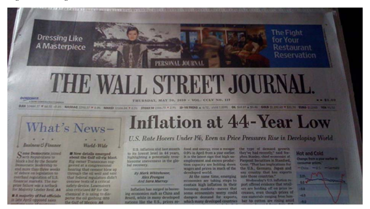
Figure 2. A change in direction is Inevitable

Statements of fact have been obtained from sources considered to be reliable, but no representation is made by this firm as to their completeness or accuracy. This firm or persons associated with it may own or have a position in any of the securities or investments mentioned, which position may change at any time, and may from time to time, sell or buy such securities or investments. No opinions expressed herein, should be construed as an offer to sell or a solicitation of an offer to acquire any securities or other investments mentioned herein.